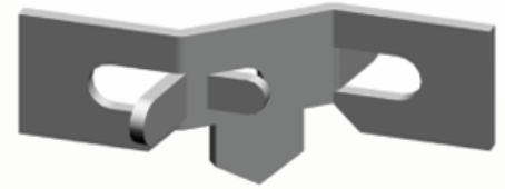
RDS-54 K-Bar, Stud Weldable Hex Steel (RA-54)