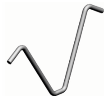
RDS-V17 Hand Weld Double Hook "V" (AR-746, RA-17)