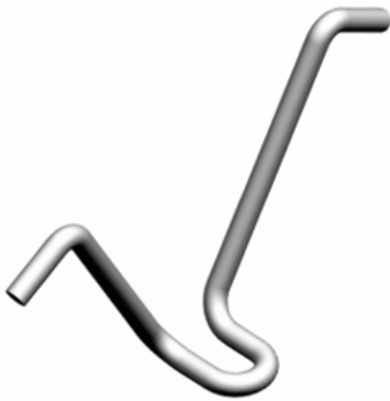
RDS-V42 Footed Double Hook "V" (RA-42)