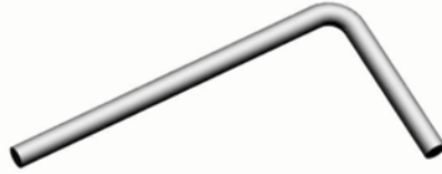
RDS-BA3 Brick Anchor (AR-733, RA-3)