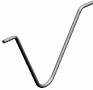
RDS-V12 Hand Weld "V"- Light-Med. Castable (AR-744, RA-12)