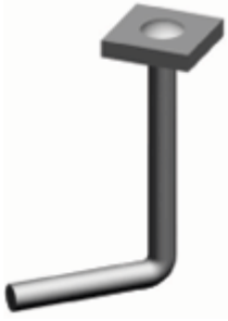
RDA-BA1 Used to Anchor Tile in High Density Linings (AS-271, RA-30)