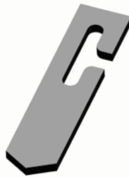
RDS-SD18 Stud Weld T-Slot Stand-off (AR-263, RA-18)