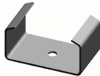
RDS-C24 "C" Clip to Attach Refractory Tile (AS-273, RA-24)