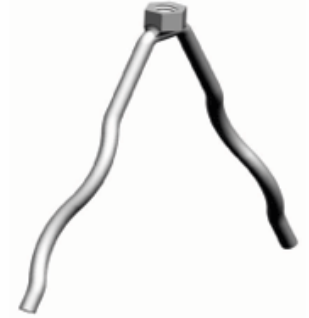
RDS-V16 Nuted-"V" Used with Threaded Stud (AR 804-TB, RA-16)