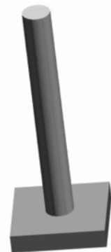
RDA-SO29 Stand-Off for Hex Steel (AS-264, RA-29)