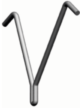
RDS-V11 Double-Hook Stud Weld "V" (AR-741, RA-11)