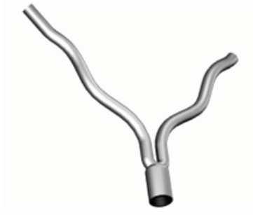
RDS-V14 Nuted-"V" Used with Threaded Stud (AR 801-TB, RA-14)