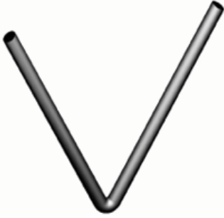
RDS-V2 "V" (AR-702, RA-2)