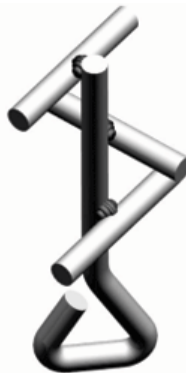
RDS-CT43 Christmas Tree (RA-43)