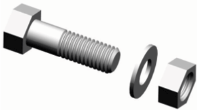
RDS-BWN Hex Bolt, Flat Washer & Hex Nut (RA-36)