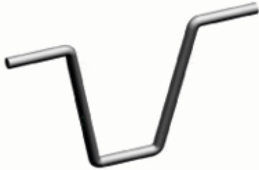
RDS-V5 Bullhorn (AR-735, RA-5)