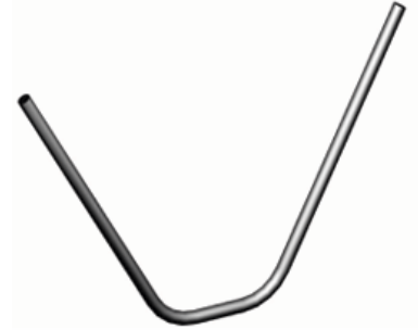
RDS-V4 Flat Based "V" (AR-734, RA-4)