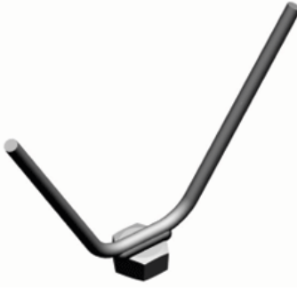
RDS-V15 Nuted-"V" Used with Threaded Stud (AR 803-TB, RA-15)