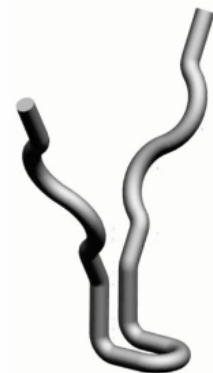
RDS-V10 Footed "V" Med.-Heavy Castable (AR 740, RA-10)