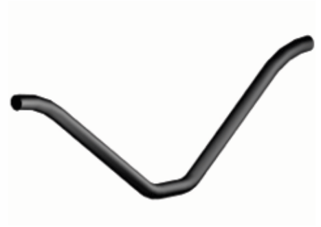
RDS-V3 Hand Weld Steerhorn-Light Weight Castable (AR-731, RA-13)