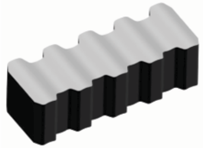
RDA-85-4000 85% Phos. Bounded Ceramic Anchor