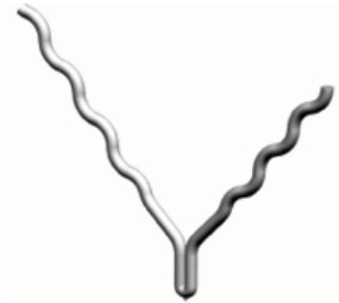
RDS-Y7 Stud Weld "Y" (AR-737, RA-7)