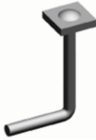
RDA-BA2 Used to Anchor Tile in High Density Linings (AS-271, RA-31)