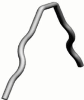
RDS-V8 Hand Weld "V" Light-Med. Castable (AR-738, RA-8)