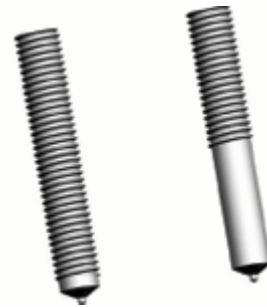
RDS-STUD Threaded Studs (RA-35)